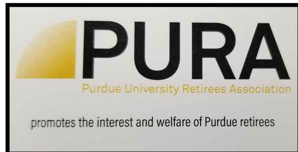
PURA's New Business Card

9-10 October —October Break. No classes.