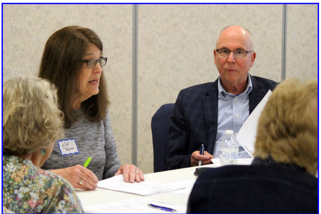
PURA committees at work.